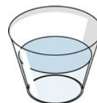
Starches (if any room)