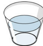
Starches (if any room)